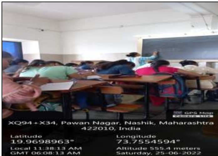
Students active participation in Cursive Writing Workshop