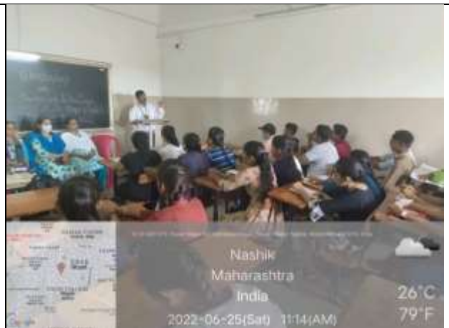
Inauguration of Workshop