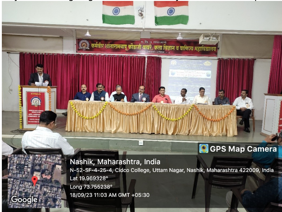
Syllabus Designing Seminar Introduction by S.R.Nikam18 sept 2023