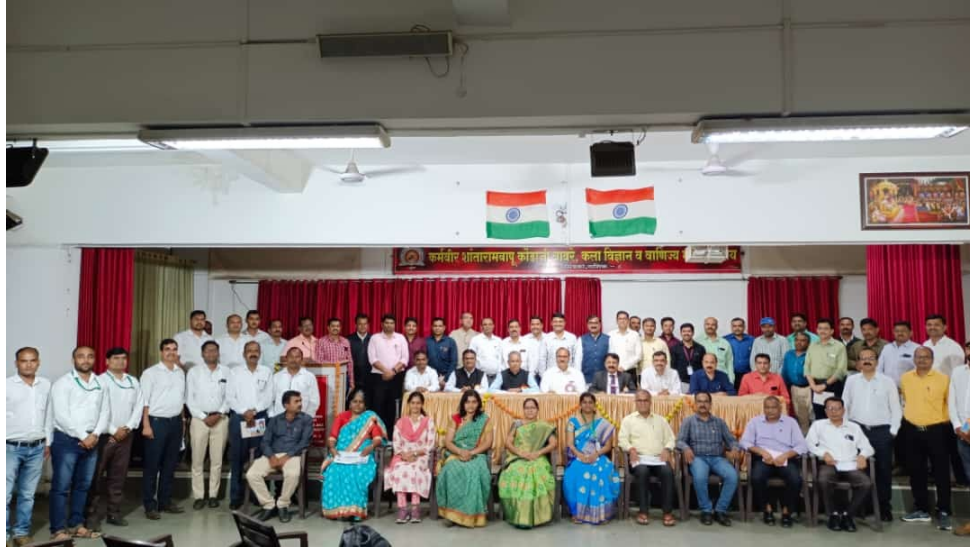
Syllabus Designing Seminar 18 sept 2023