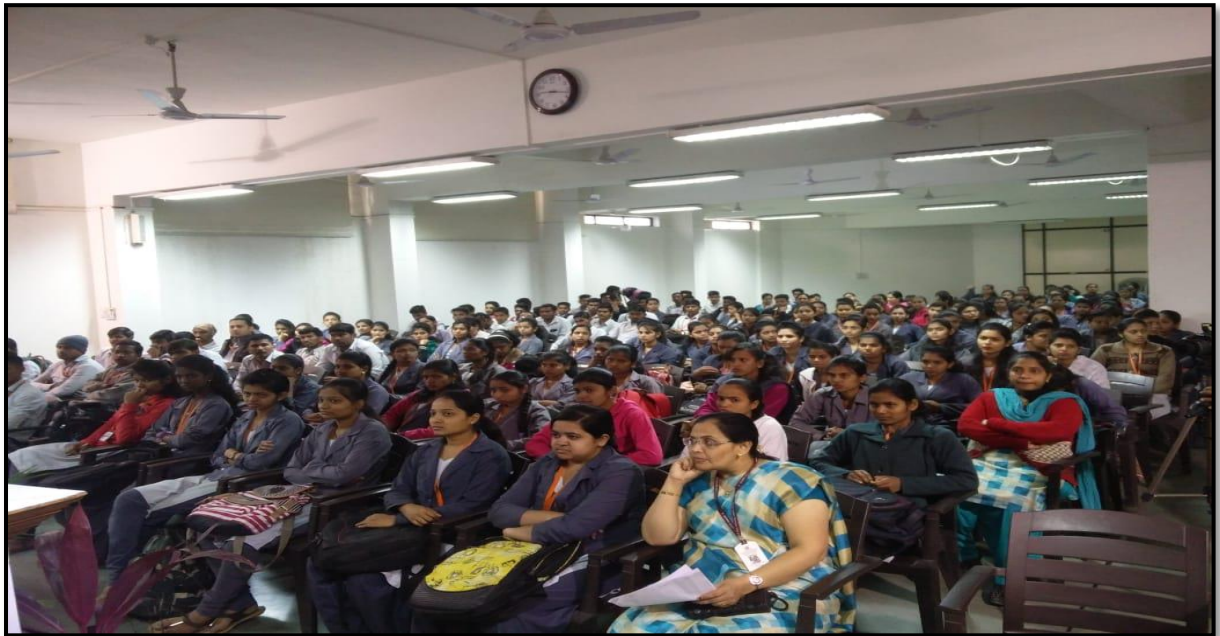
Student keenly listening to the guidance delivered by the Speaker. College students along with Staff Attended the Guest Lecture