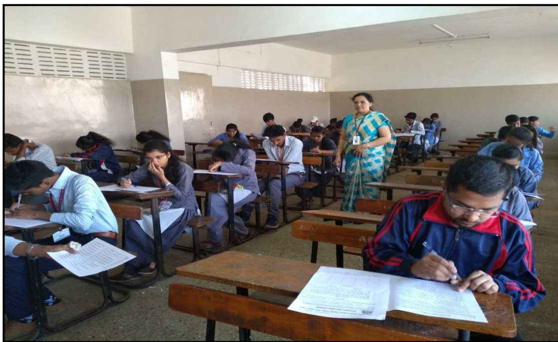
Visited at Exam Place

As per one of the guidelines by NAAC, apart from traditional education students need to get buildup their co-curricular knowledge also. In order to strengthen the general knowledge ability of the students, the college has decided to organize General Knowledge Exam with collaboration of Carrier Development Academy, Nagpur.