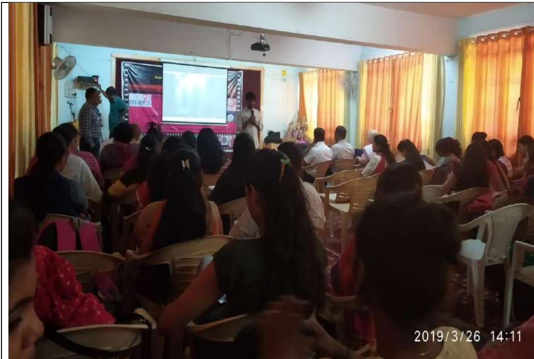
Expressing views about the film