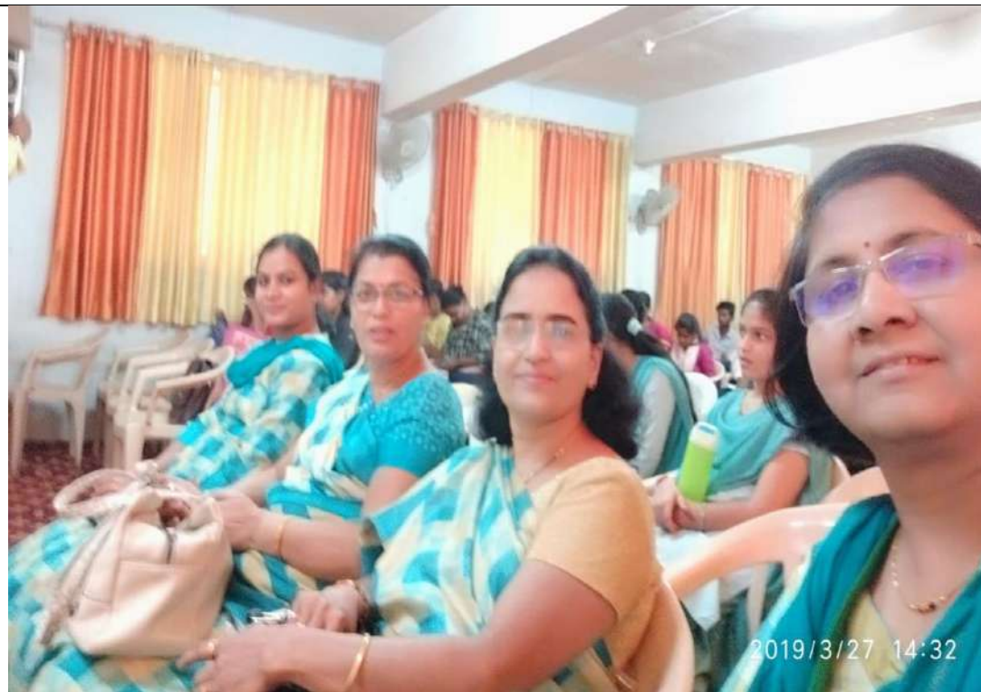
Faculty members also attended the screening of films