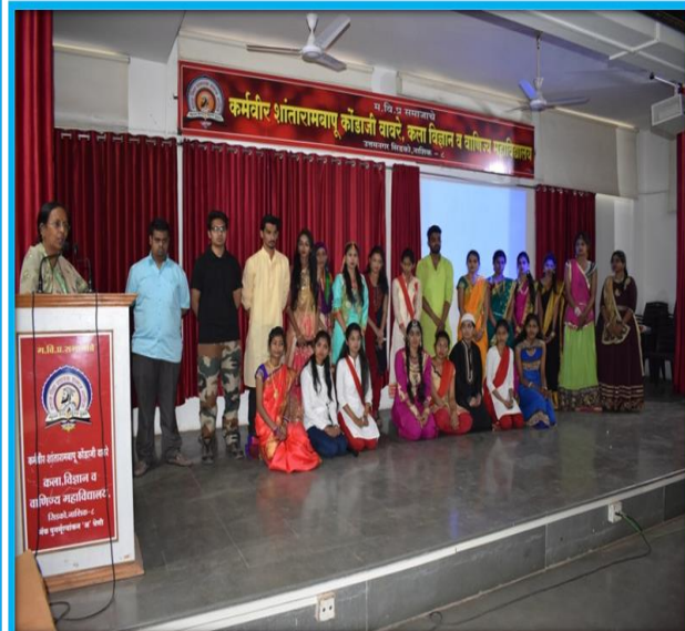
Group Activity on “One India” Theme

Email for Submission of soft copy (Word File and Photos): kskwiqac4theycle@gmail.com