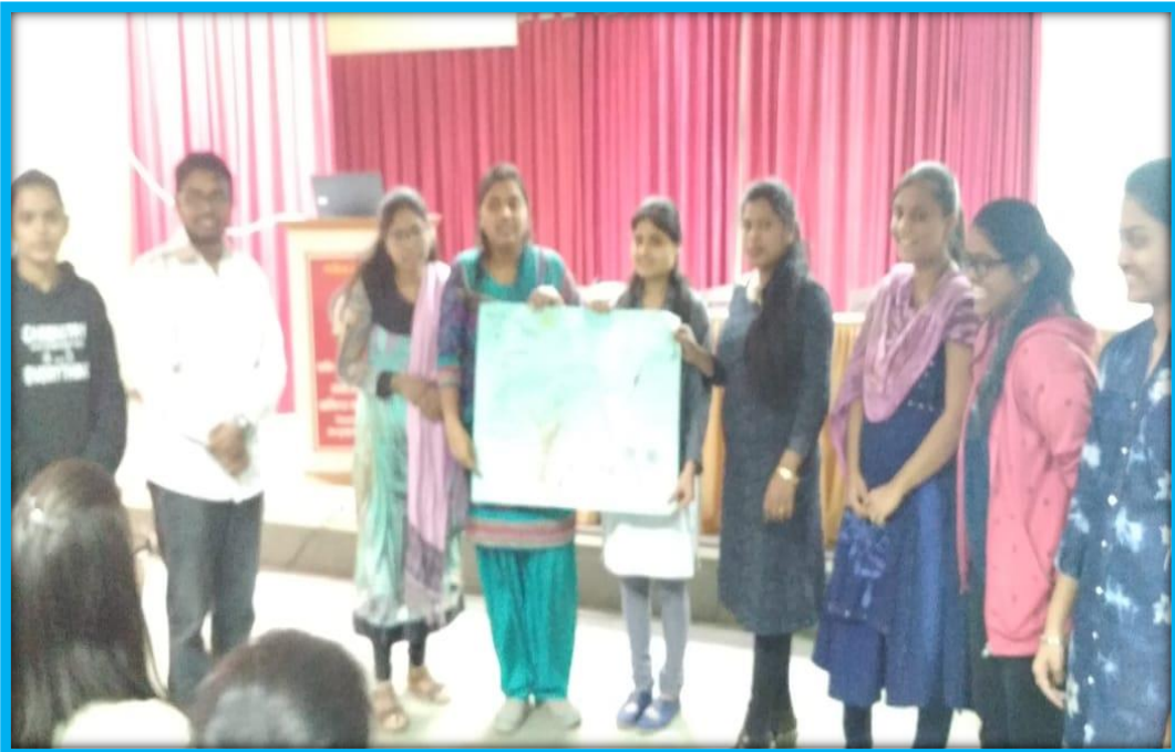
Poster Presentation by Team