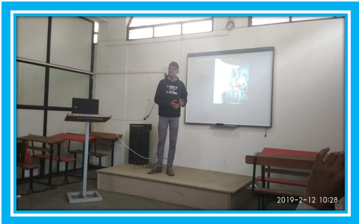
Presentation on topic “Shri Chhatrapati Shivaji Maharaj”