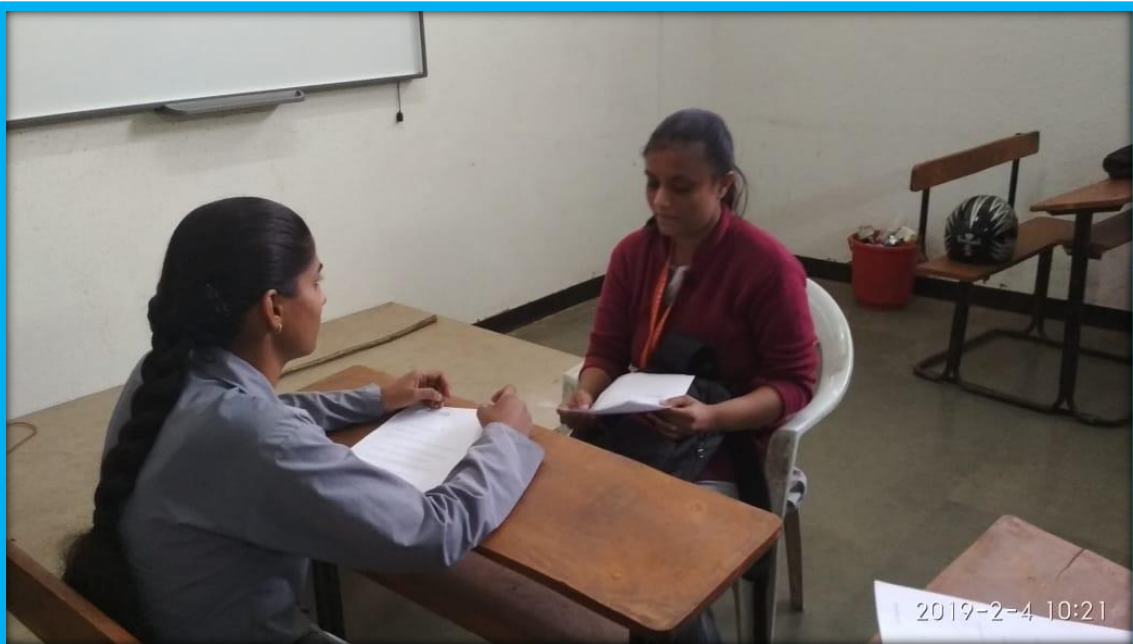
Interview Facing Demo