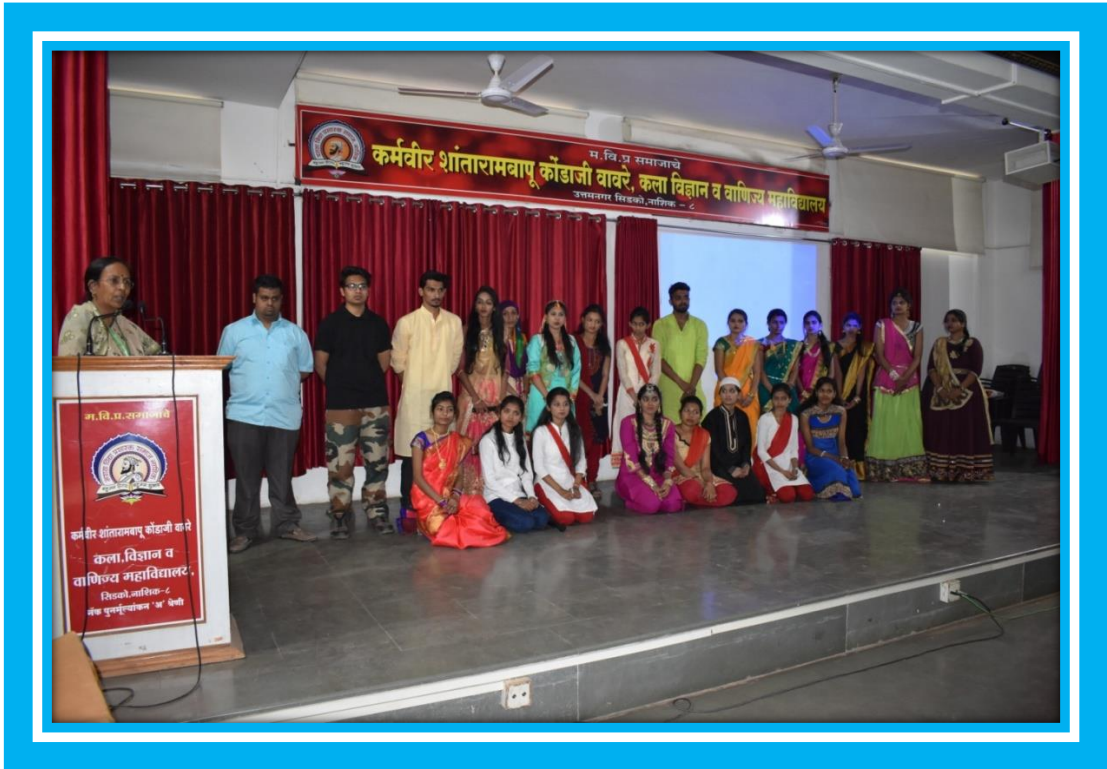
Group Activity on “One India” Theme