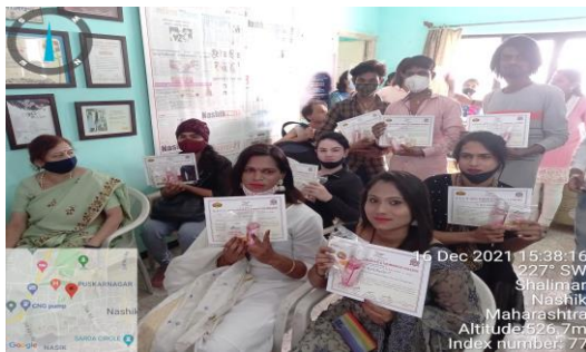
Participants with their certificate