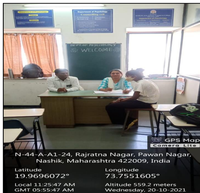
Counselling Room at Psychology Department