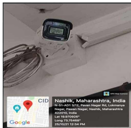
CCTV In The Staff Room