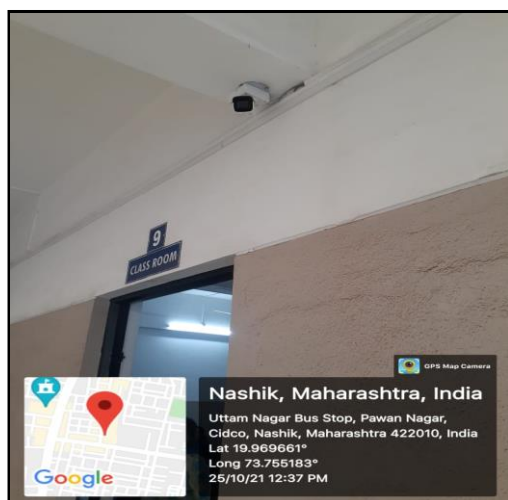
CCTV At First floor of New Building