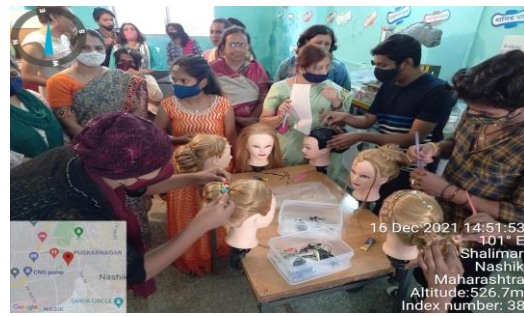
Hair style competition