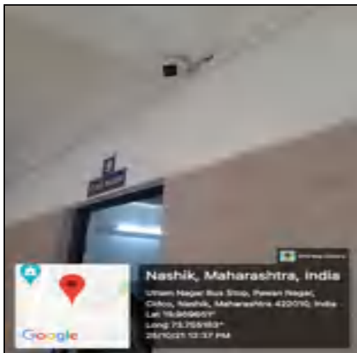
CCTV At First floor of New Building