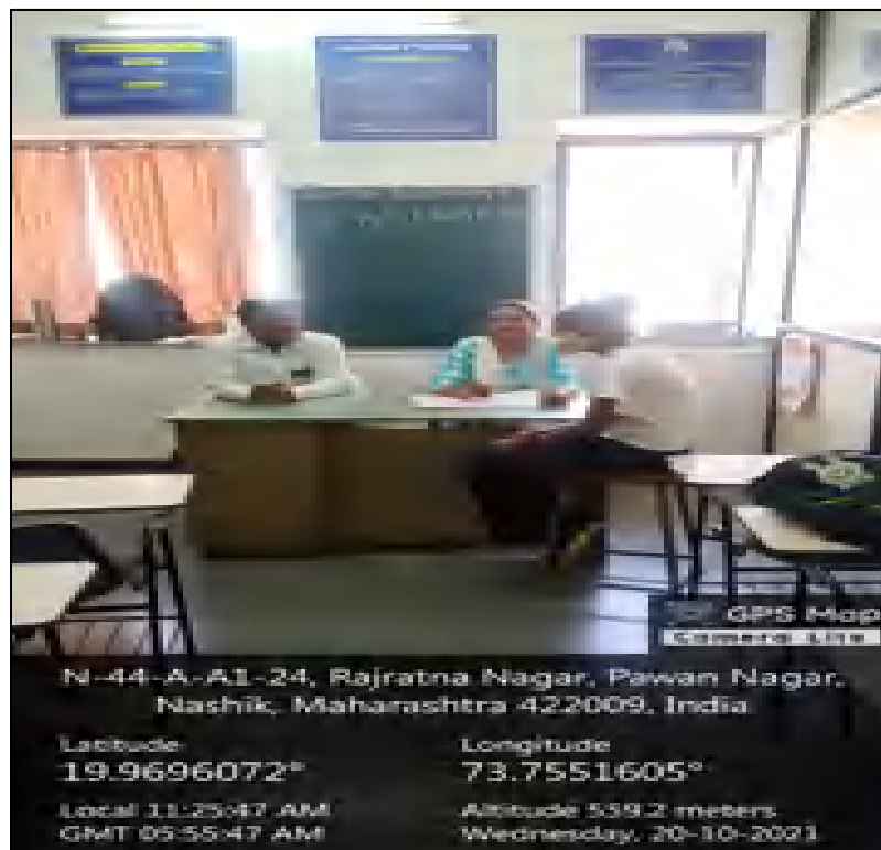
Counselling Room At Psychology Department