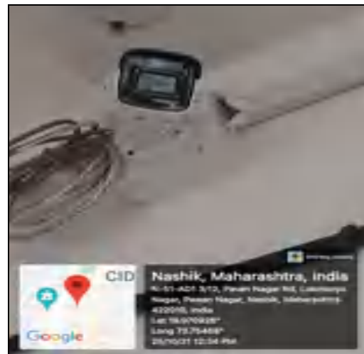
CCTV In The Staff Room